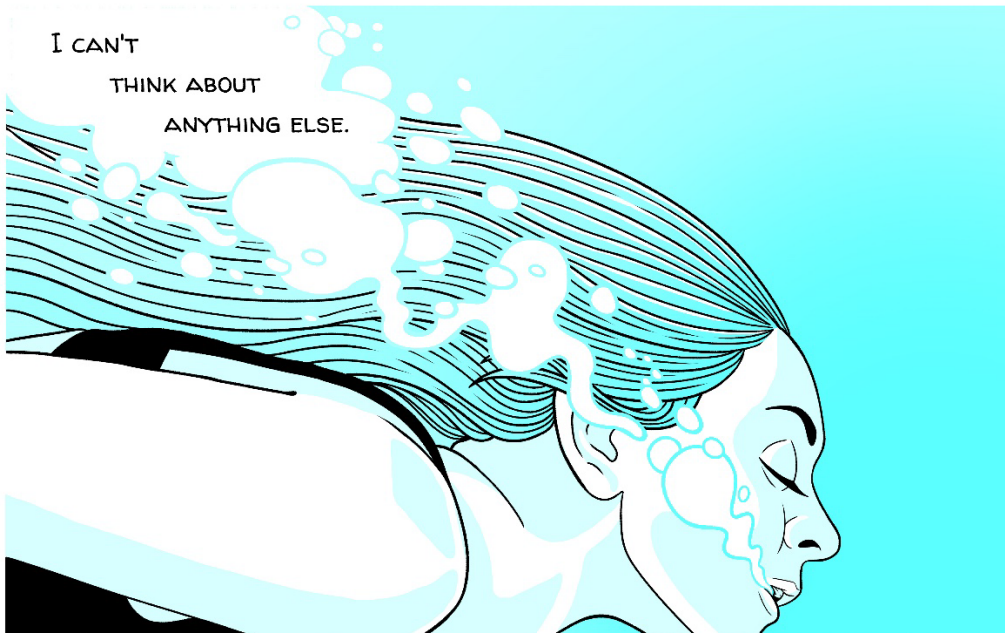
Isabella Rotman, Like the Tide, Page 3 , 2020, 16 1/16 x 22 1/16 inches, digital print