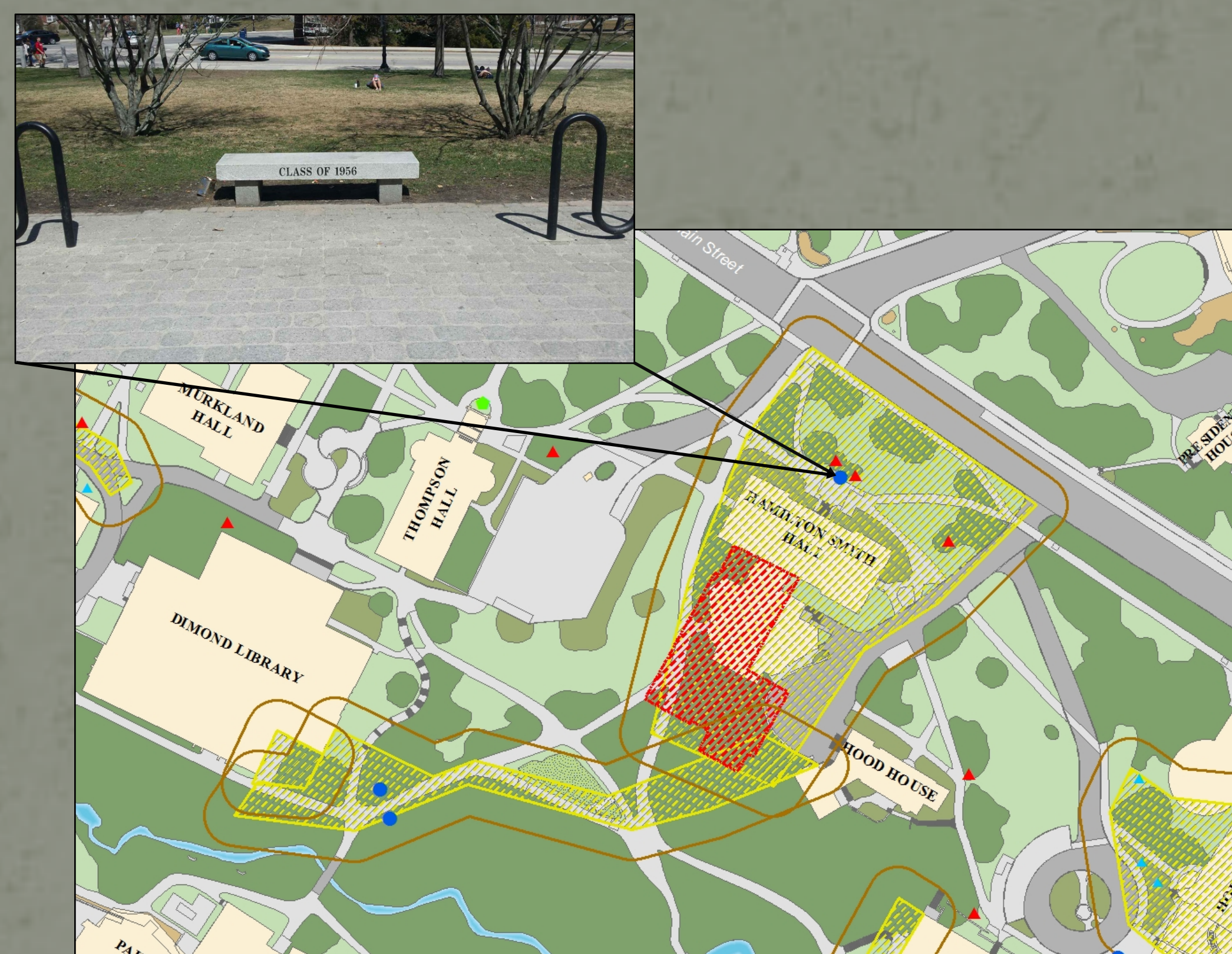
Figure 3a: Hamilton-Smith Construction Zones