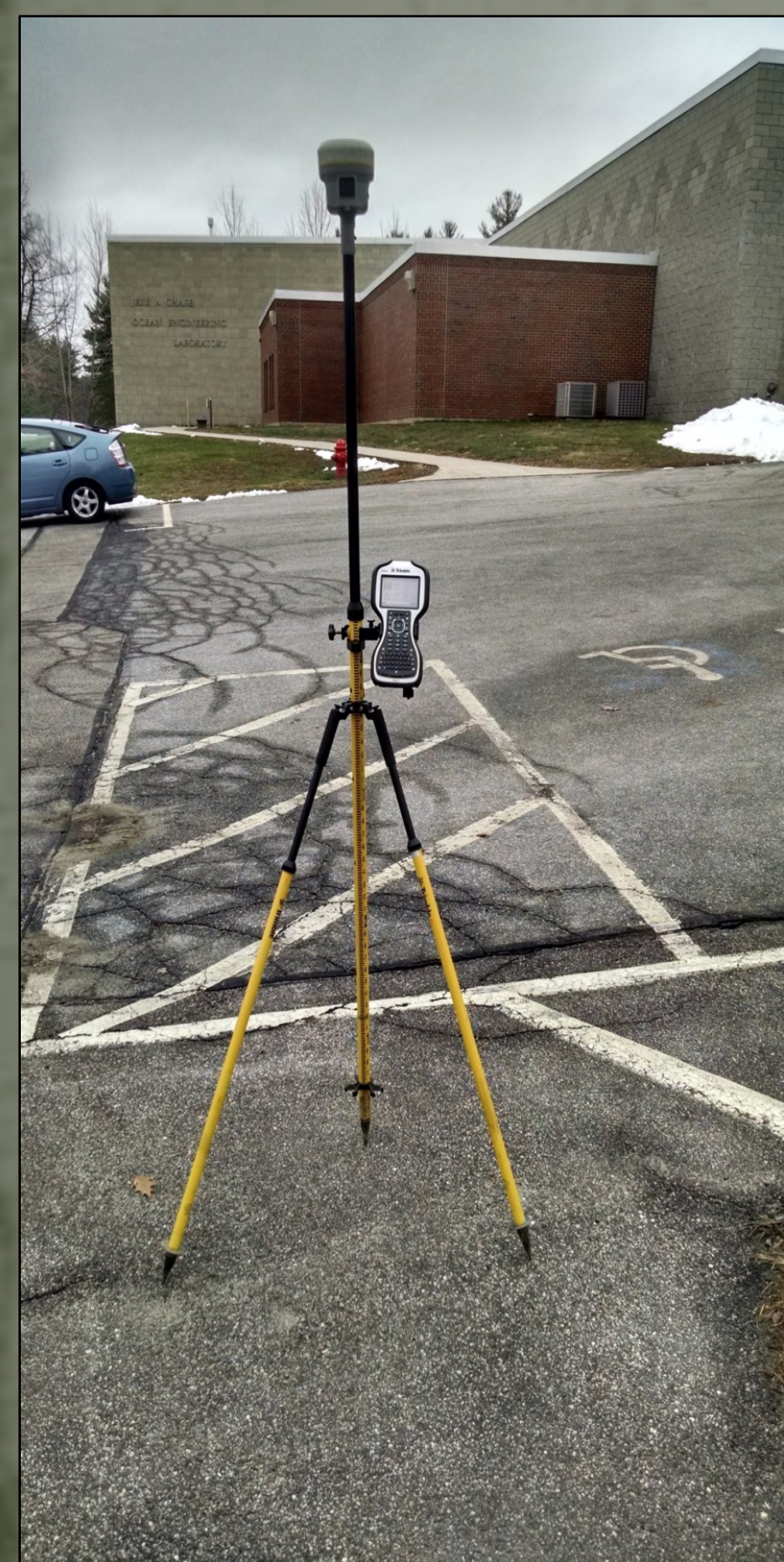
Figure 1a: Trimble R10 RTK GPS