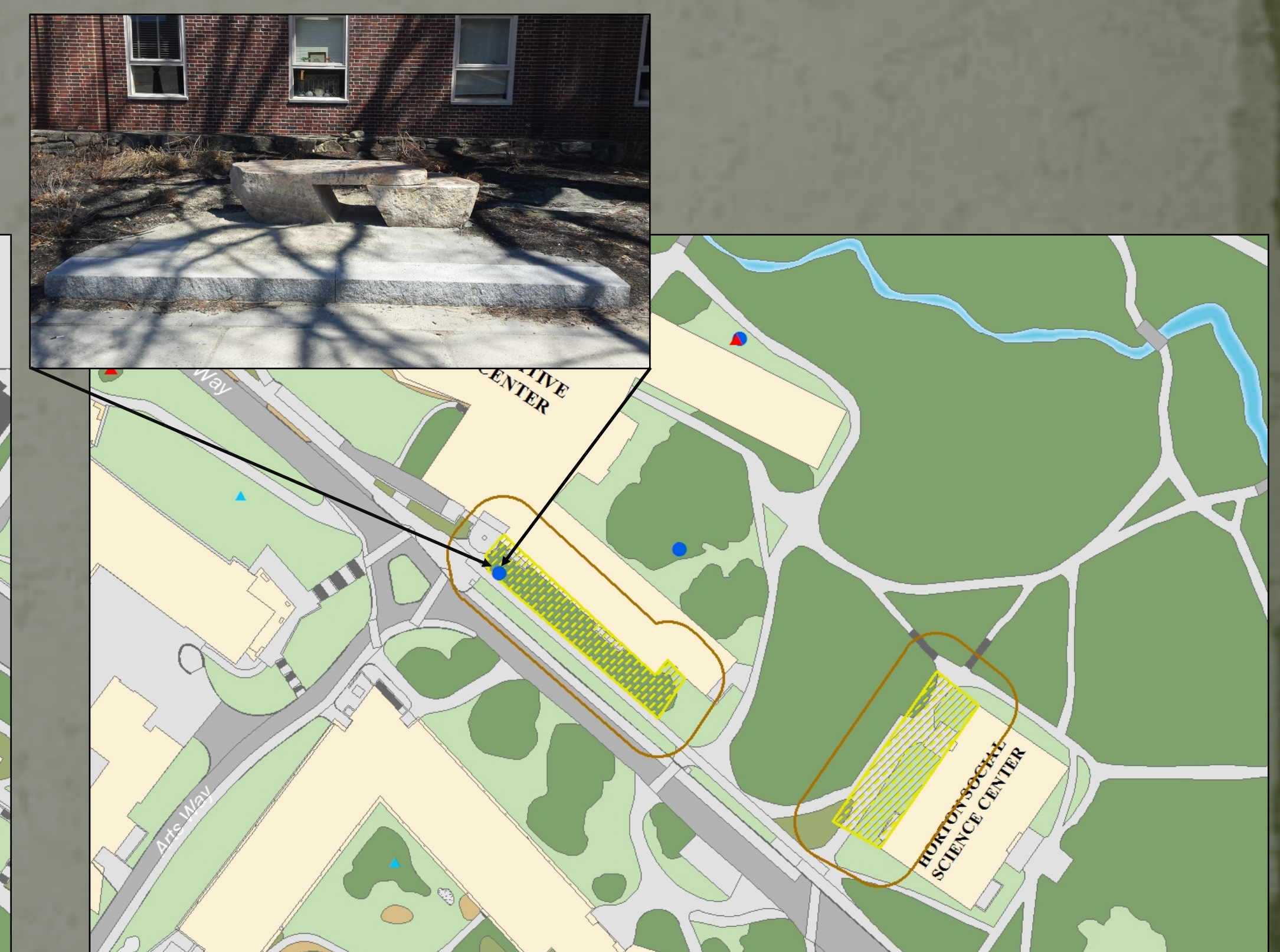
Figure 3d: PCAC Construction Zone