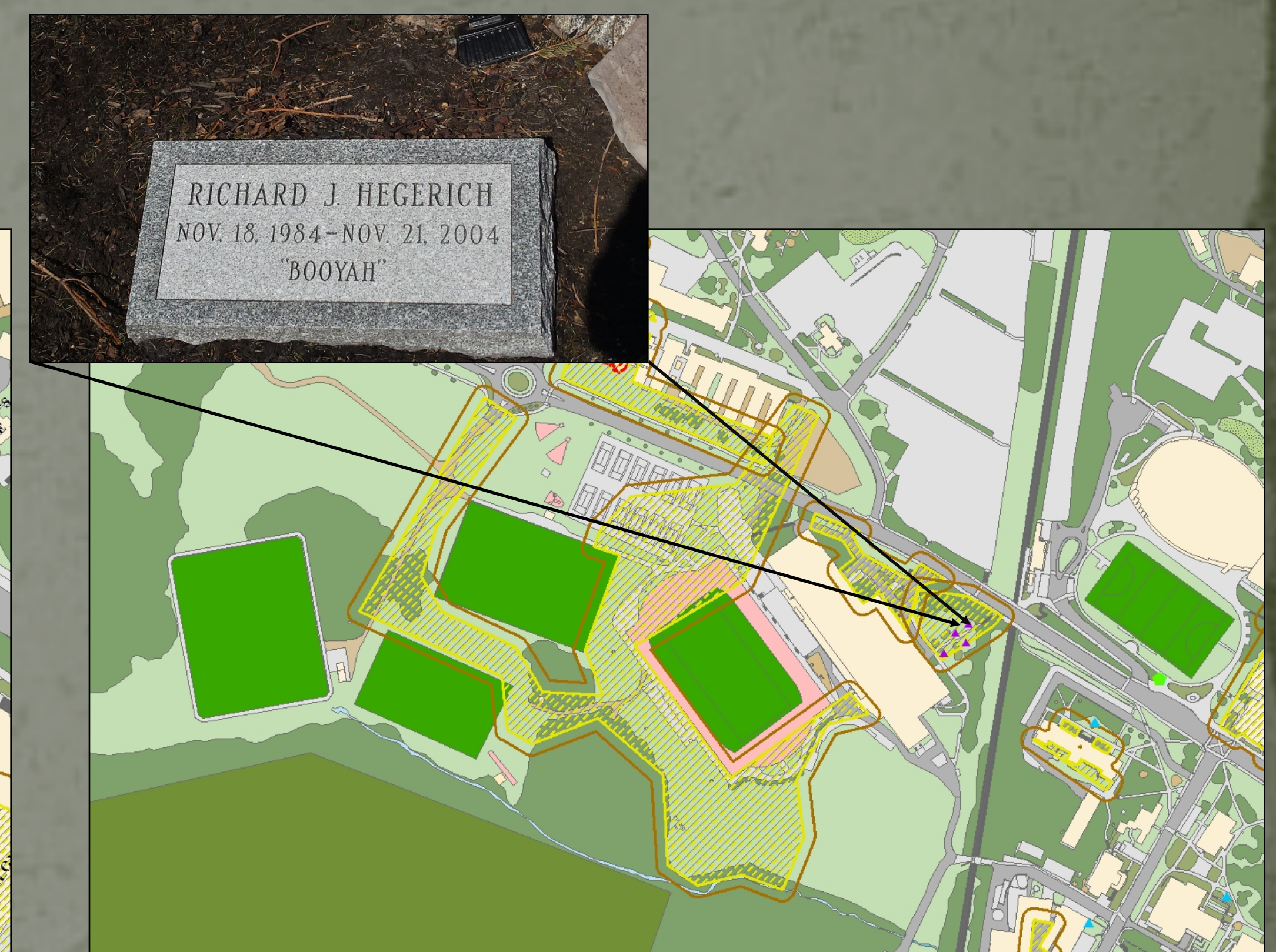
Figure 3b: Field House Construction Zones