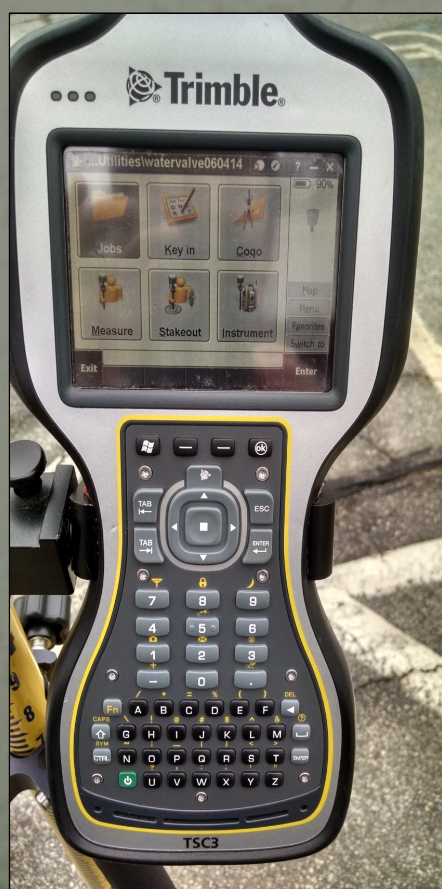
Figure 1b: TSC3 Trimble Data Logger