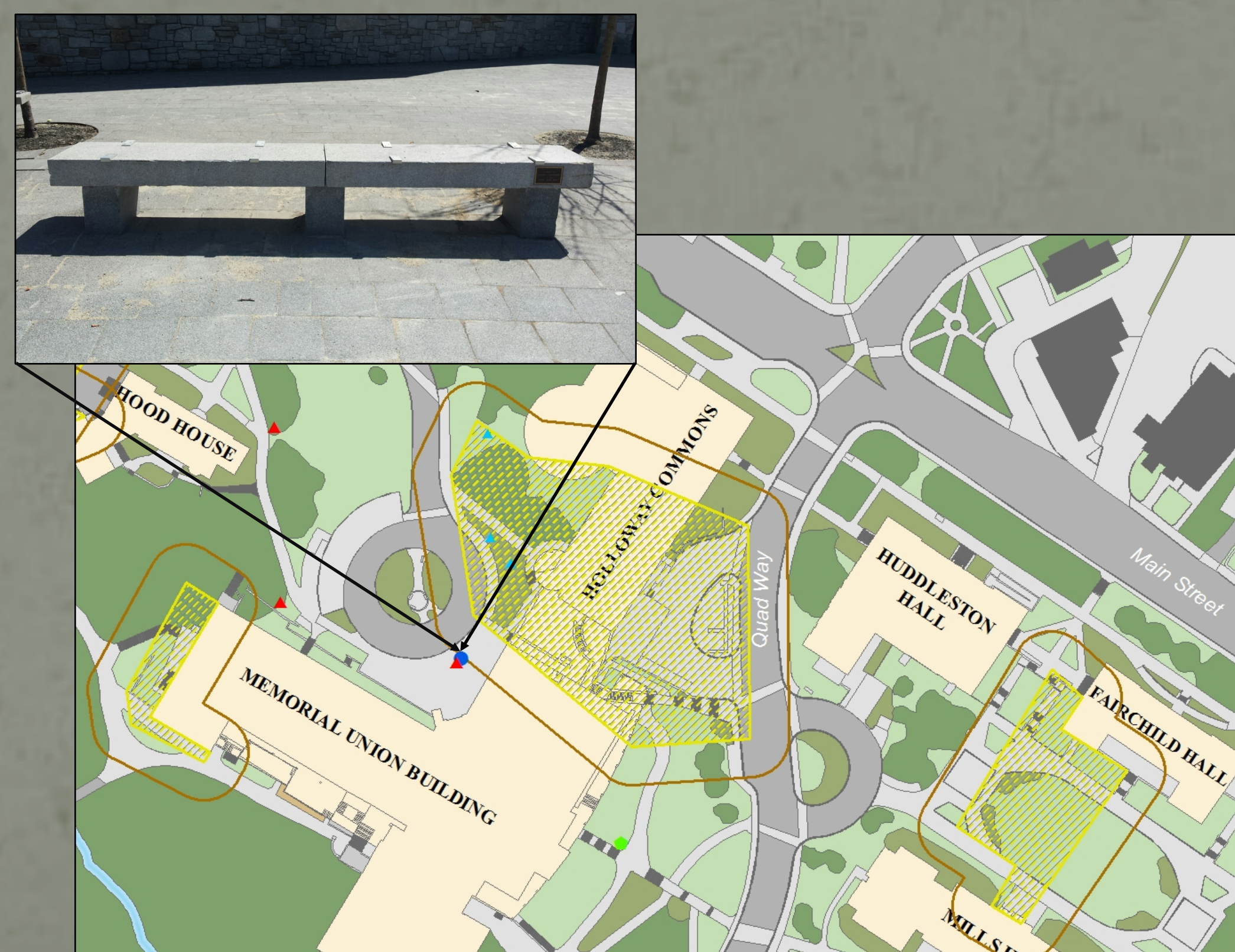
Figure 3c: Holloway Commons Construction Zone