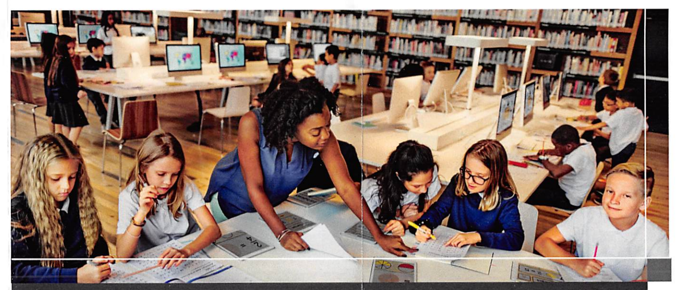
The TCAP is a way to really make you be aware of how you are as a reflective and practicing teacher.