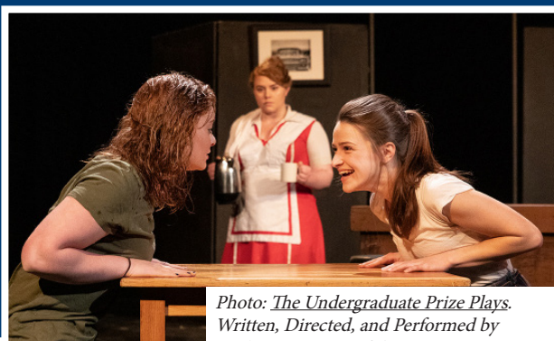
Photo: The Undergraduate Prize Plays . Written, Directed, and Performed by students as a part of the Main Stage Season.

Immerse yourself in this comprehensive training program by learning from highly-trained professionals who are at the top of their fields in internationally-recognized mainstream methodologies and who are also leading innovators in actor and director training. Benefit from the ongoing attention to artistic development that each student receives from faculty across the entire department; Expect to grow as an emerging professional with training from national and international guest artists and a department that features more full-time faculty than almost any other Theatre BA program in New England.