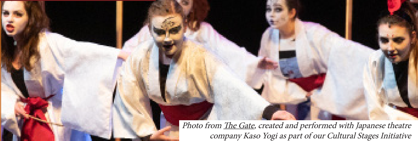
Photo from The Gate , created and performed with Japanese theatre company Kasô Yogi as part of our Cultural Stages Initiative

University of New Hampshire Theatre and Dance