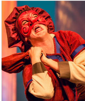
Photo: Comedy of Errors . Students participated in a commedia dell'arte master class and used traditional masks in performance.

Here at UNH, we have one of the only programs in the country designed to integrate both actor and director training to create the self-sufficient theatre artist. Created for highly motivated students, this option is focused on fully developing the actor and/or the director as a powerful interpretive and creative artist. Students in the Acting & Directing Option strive for excellence through highly challenging coursework, performance-based projects, productions and special workshops with guest artists and instructors.